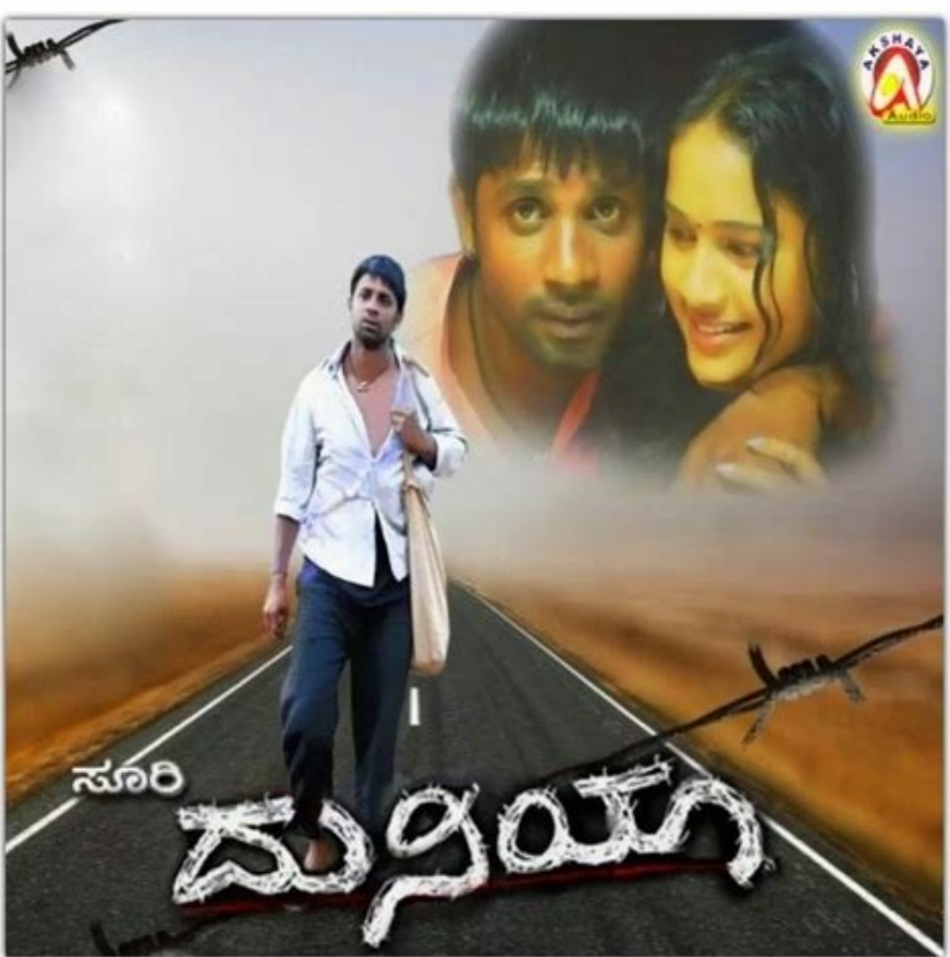
Duniya kannada movie songs free download. Duniya vijay kannada movie mp3 songs free download.